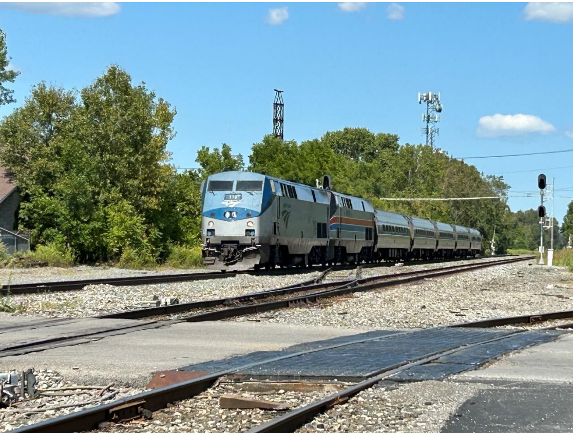
Double heading diesels on just five Amfleet coaches? The power balancing move of train #64 was captured September 3, 2024 at the Robinson Street crossing, North Tonawanda, NY.